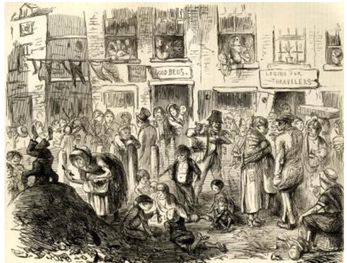
Fig. 1—London in the 1820's

While chronic infusion was not possible, patients underwent a short-term recovery before sepsis or ongoing water losses led to death. In 1834 Schönlein (Fig. 2) described the lower extremity purpura, arthralgias and colic that are characteristic of the condition that bears his name. In the 1880's, Edouard Henoche (Fig. 2) added the presence of renal disease to Schönlein's purpura and the full-blown syndrome was described. Another founder was Lucas, who in 1883 described renal rickets in association with renal disease. He also noted poor growth. Between 1900 and 1920, several German physicians defined the volume, chemical composition, and frequency of urination in children of different ages. Ritter von Reuss was a leader of this line of inquiry. The nephrotic