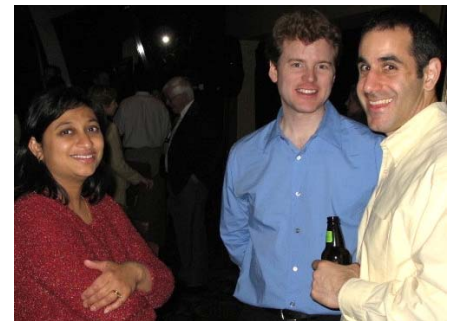
Member Reception, View Lounge, Marriott Hotel